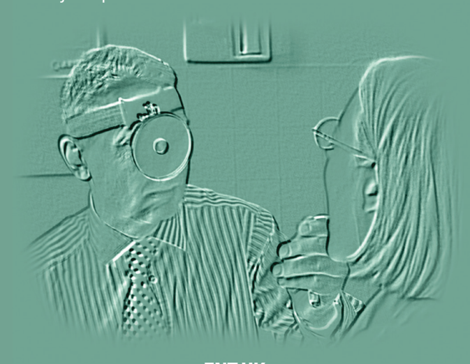
ENT.UK The Royal College of Surgeons of England 35-43 Lincoln's Inn Fields London WC2A 3PE

ENT-UK is the professional Association for British Ear, Nose and Throat Surgeons and related professionals. This leaflet provides some background information about otosclerosis and stapedotomy. It may be helpful in the discussions you have with your specialist when deciding on possible treatment. This information leaflet is to support and not to substitute the discussion between you and your specialist. Before you give your consent to the treatment, you should raise any concerns with your specialist.